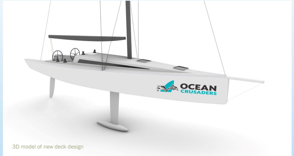
3D model of new deck design