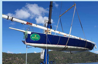
The delivery from Sydney to Brisbane