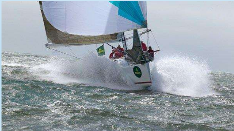
J-Bird III on her way to winning the Trans-Pacific Yacht Race in 2001

The yacht can reach speeds in excess of 20 knots and has hit a top speed of 28.2 knots with former owners. Light, fast and exhilarating to sail, this will be the only yacht of it's type available for a corporate experience in Brisbane, whilst also being made available for the race regattas in Queensland and Geelong.