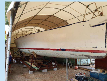
In her new home for rebuild