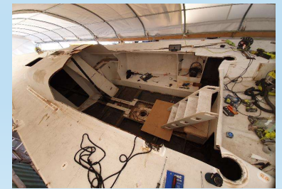
The old deck makes way for the new deck